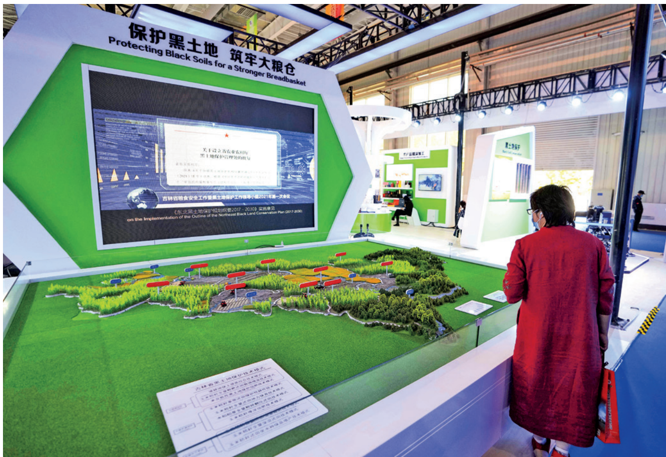
A smart soil protection technology model is on display at an exhibition in Changchun, northeast China's Jilin Province, on September 24, 2021. Xu Chang