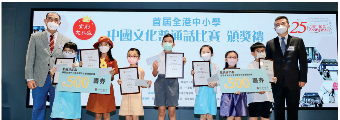
The award ceremony for a Putonghua (standard Chinese language) competition for primary and secondary schools takes place in Hong Kong, south China, on June 12. Huang Qiantian

“We have confidence in the long-term prosperity of Hong Kong,” Ho said. ■