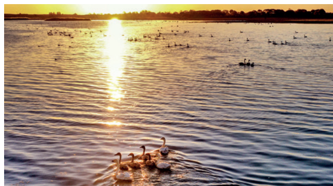
Swans are seen at the Hekou Reservoir wetland in Yulin, northwest China's Shaanxi Province, on October 31, 2021. Tao Ming

Xi also called for improving the Belt and Road Initiative International Green Development Coalition, the Green Investment Principles for the Belt and Road Development and other multilateral cooperation platforms “to make green a defining feature of Belt and Road cooperation.”