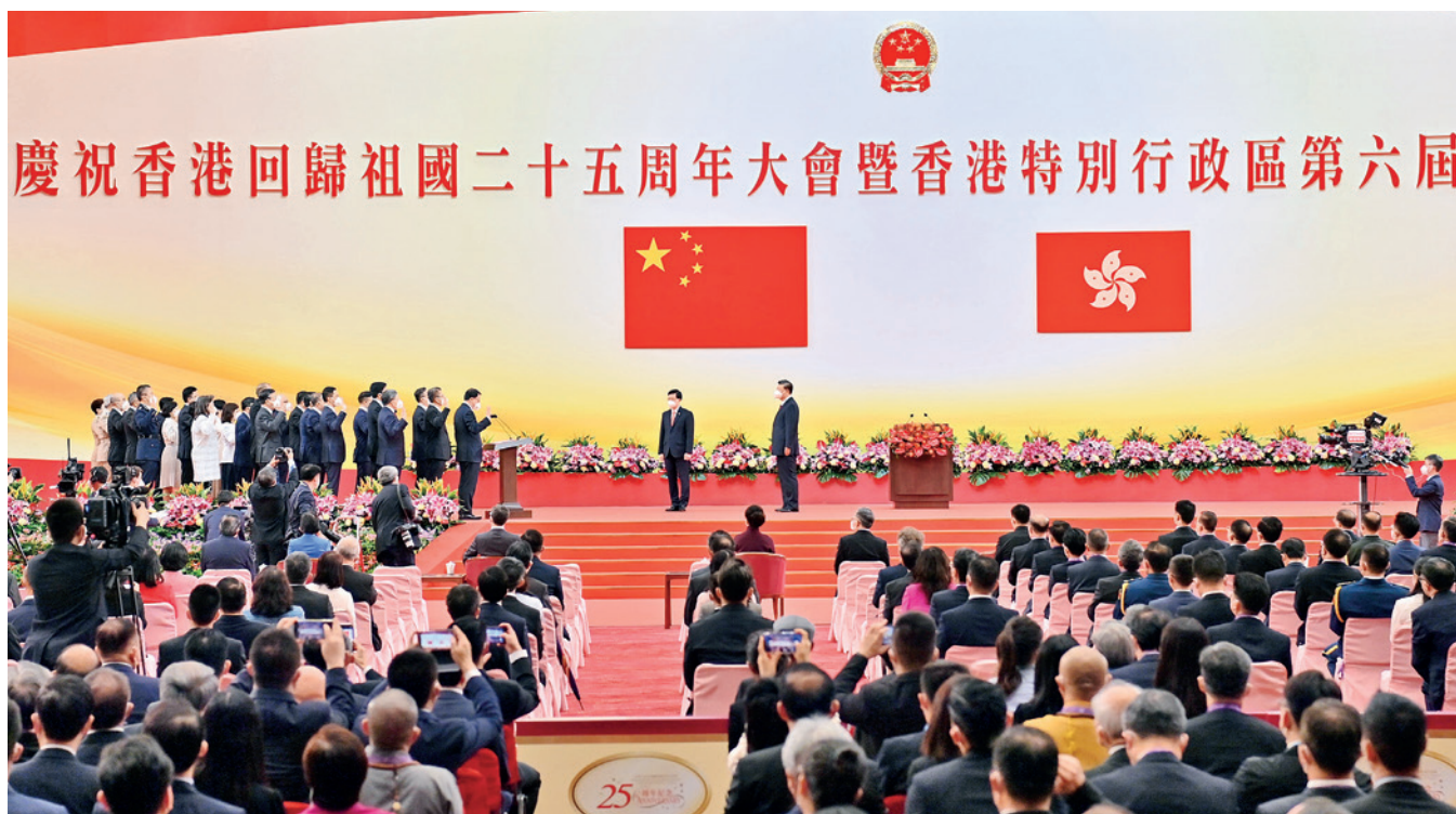
President Xi Jinping administers oath of office to principal officials of the sixth-term government of the Hong Kong Special Administrative Region at the Hong Kong Convention and Exhibition Center on July 1.

Since its return, Hong Kong has overcome various hardships and challenges and advanced steadily forward. Be it the global financial crisis, the COVID-19 epidemic, or social unrest, none of them have stopped Hong Kong from marching forward. Over the past 25 years, Hong Kong's economy has been thriving, its status as an international financial, shipping, and trading center has been maintained, and its innovative science and technology industries have been booming. Hong Kong has remained one of the most liberal and open economies in the world, it has also maintained a world-class business environment, its previous laws including the practice of the common law have been maintained and developed, various social programs have made all-around progress, and