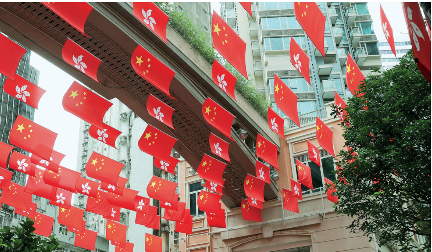
Photo taken on June 16 shows Lee Tung Street before the 25th anniversary of Hong Kong's return to the motherland in Hong Kong, south China.

our cause advances in the right direction in a sound and sustained manner.