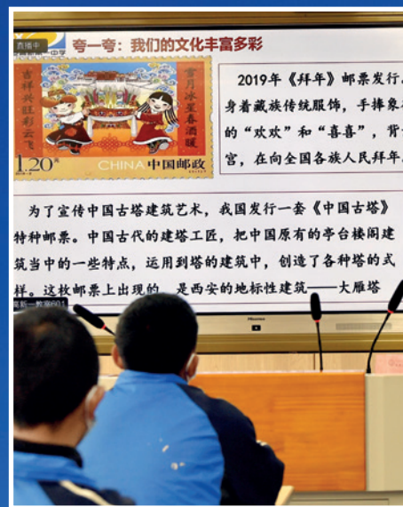
Students at Lhasa Ali high school attend a class by a teacher at the Xi'an Gaoxin No.1 High School via an online education system in Lhasa, southwest China's Tibet Autonomous Region, on April 8.