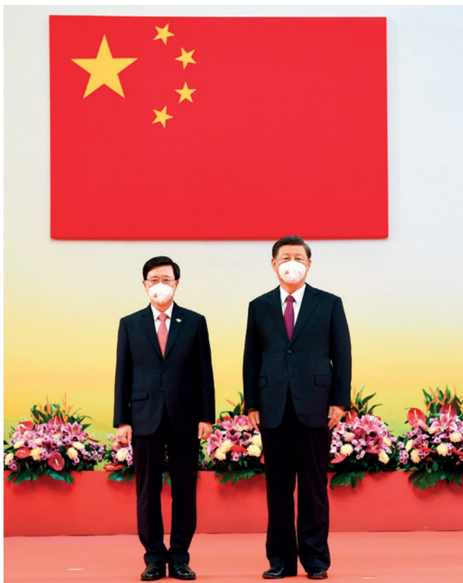
President Xi Jinping poses for a photo with newly inaugurated Chief Executive of the Hong Kong Special Administrative Region John Lee Ka-chiu at the Hong Kong Convention and Exhibition Center on July 1.