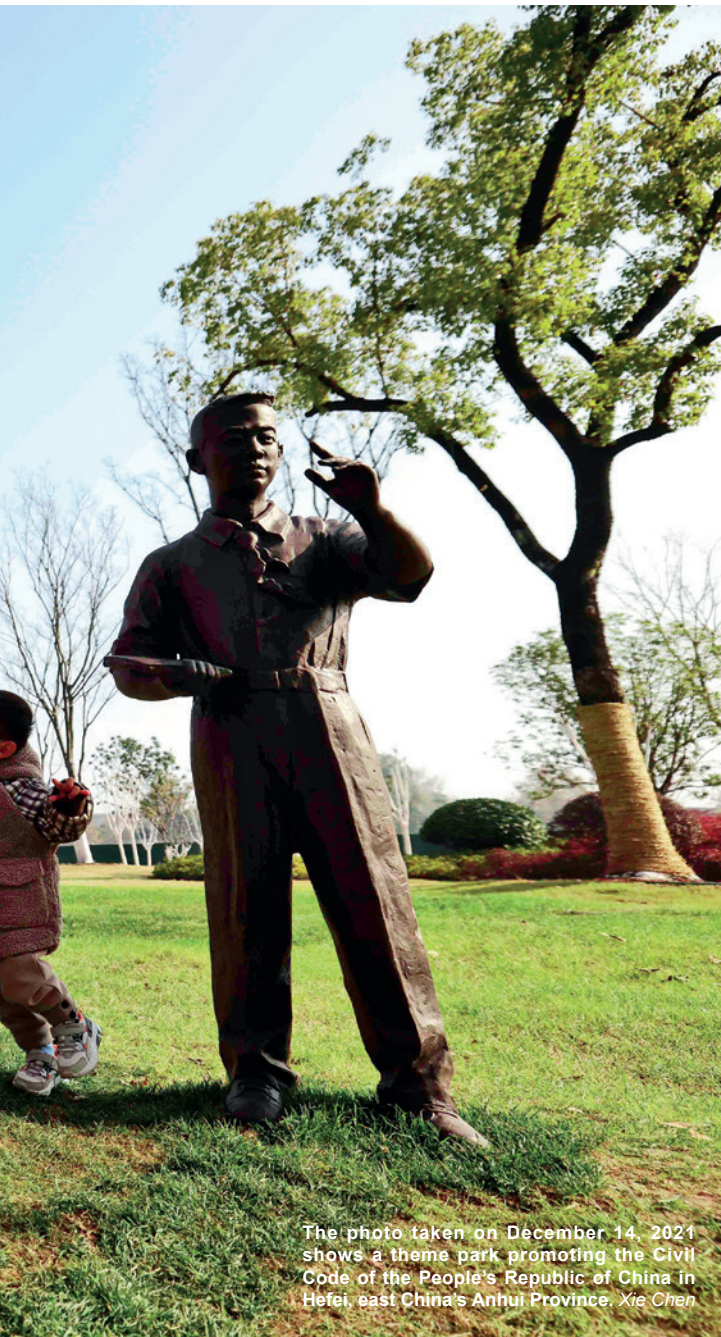
The photo taken on December 14, 2021 shows a theme park promoting the Civil Code of the People's Republic of China in Hefei, east China's Anhui Province. Xie Chen

'The number of new laws enacted over the last decade has increased by one third compared with the decade before, and the number of laws amended has nearly doubled,' Xu Anbiao said.