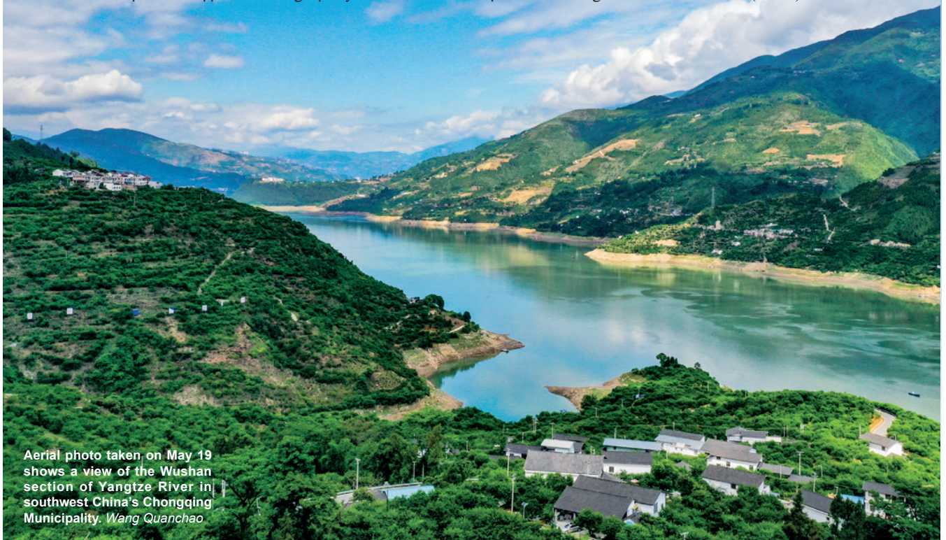
Aerial photo taken on May 19 shows a view of the Wushan section of Yangtze River in southwest China's Chongqing Municipality.

– Efforts should be made to blaze a new trail of green development that gives priority to the ecology, so as to provide powerful support for the high-quality and sustainable development of the Yangtze River Economic Belt. (Xinhua)