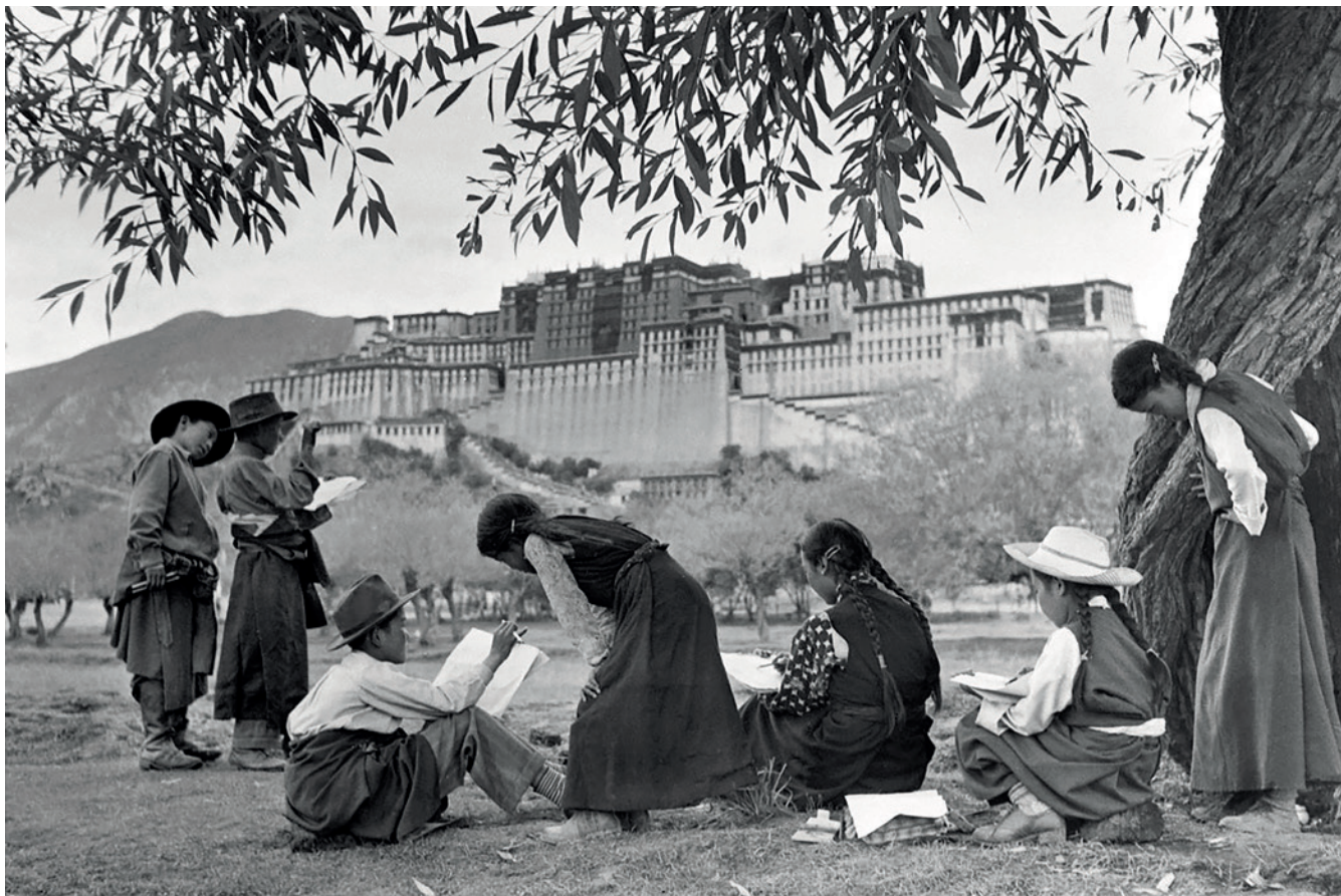
Primary school students in Tibet practice drawing in front of the Potala Palace in the 1950s. Ren Yongzhao