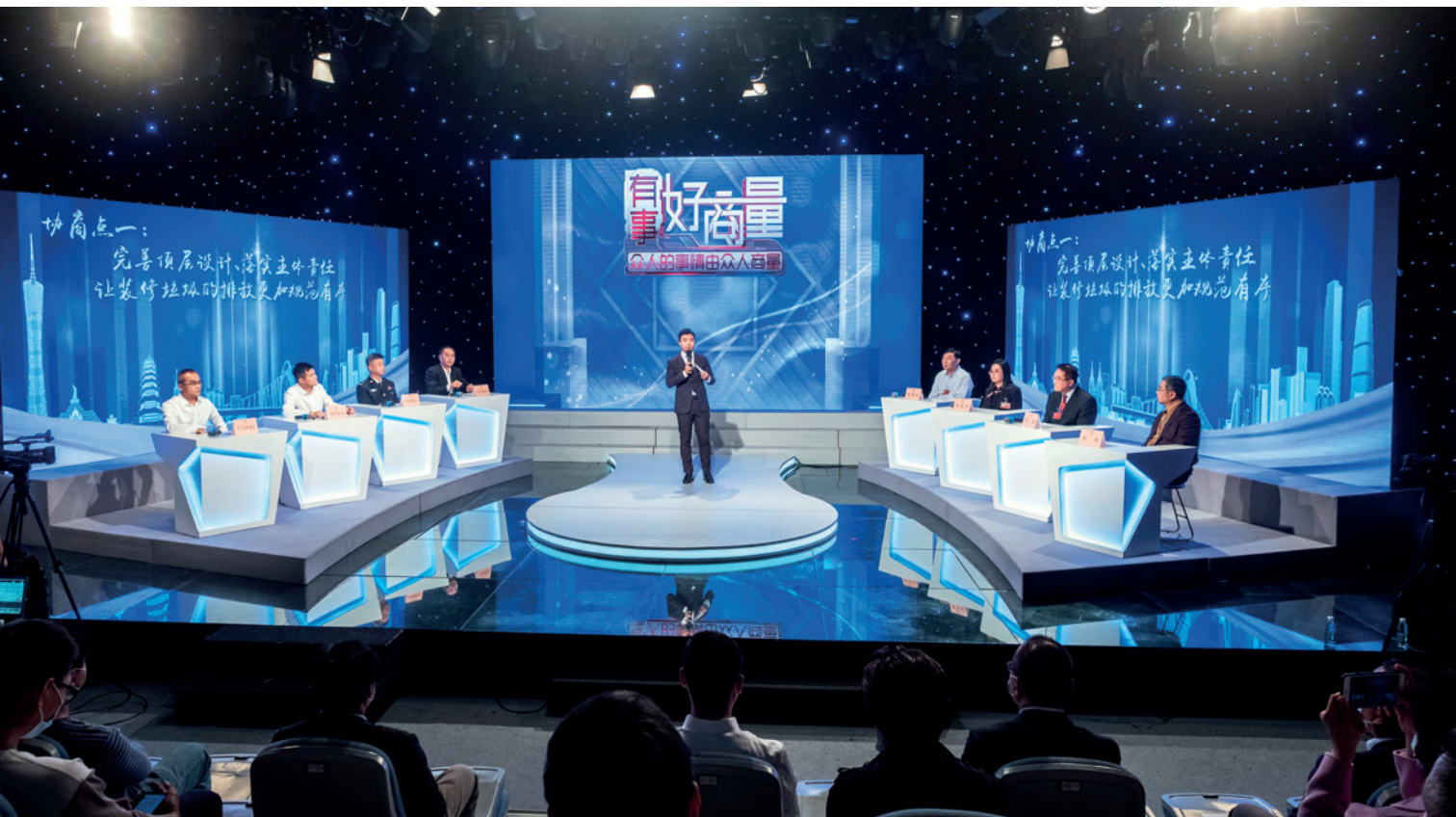
Members of the local Chinese People's Political Consultative Conference, government agencies representatives and real estate management companies discuss ways to improve waste disposal in residential communities in Guangzhou, south China's Guangdong Province, on November 19, 2021.