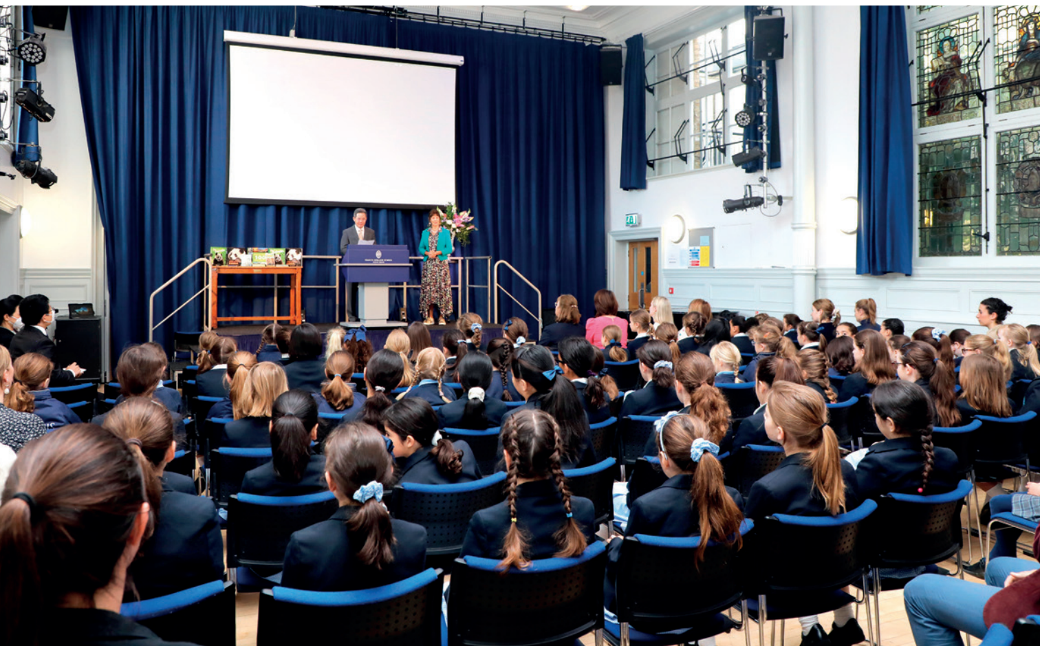
Chinese Ambassador to the UK Zheng Zeguang reads a reply letter from President Xi Jinping to primary school students at Francis Holland School on the issue of climate change on April 21.

President Xi Jinping said that China has been taking unprecedented steps to tackle climate change, and has made remarkable progress, adding that the country will continue making even greater achievements.