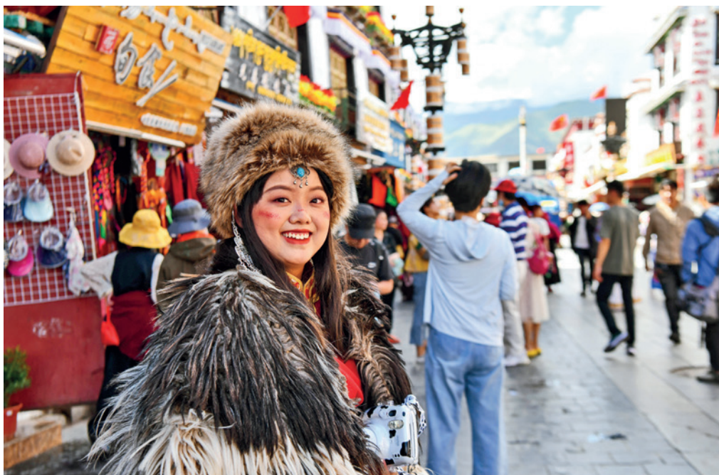
A tourist poses on Barkhor Street that winds around Jokhang Monastery in Lhasa, southwest China's Tibet Autonomous Region, on July 23, 2021.

Their house, a three-story Tibetan building, is decorated