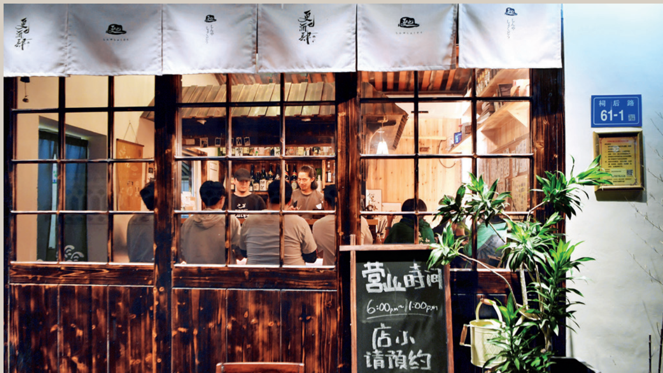
Photo taken on May 1 shows Wang Shengfen's (standing) late night canteen in Xiamen, southeast China's Fujian Province. Wei Peiquan