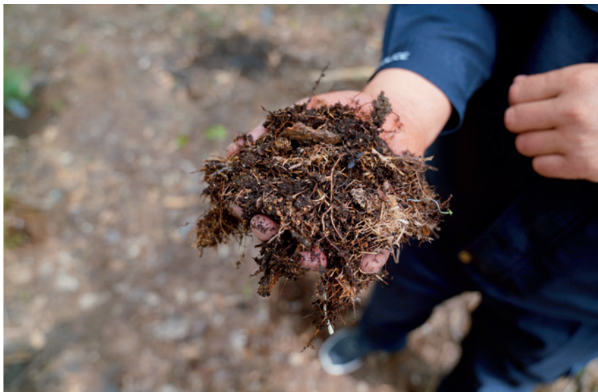
A handful of black soil in Yichun, northeast China's Heilongjiang Province, on May 19.

phased and targeted manner, according to the law.