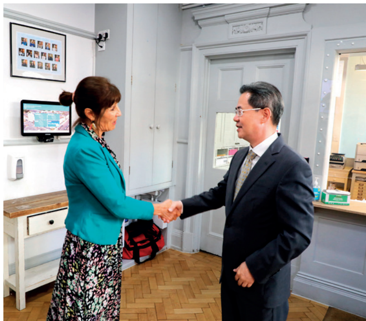
Chinese Ambassador to the UK Zheng Zeguang shakes hands with Lucy Elphinstone, headmistress of Francis Holland School in London, England on April 21. Ren Chao

The China National Botanical Garden was officially inaugurated in Beijing in April with a planned area of 600 hectares and the garden has more than 30,000 kinds of plants and 5 million representative plant specimens from