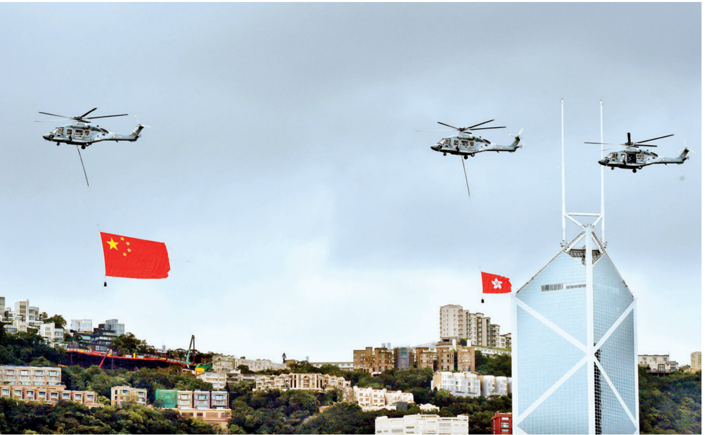
Helicopters carrying China's national flag and the flag of the Hong Kong Special Administrative Region fly over Hong Kong, south China, during a flag-raising ceremony to celebrate the 25th anniversary of Hong Kong's return to the motherland on July 1.

work together to safeguard harmony and stability. Hong Kong is the home of all its people, and harmony in a family brings success in everything. Through trials and tribulations, now we keenly feel that Hong Kong cannot withstand chaos and will not afford to have any, and we also deeply feel that the development of Hong Kong allows no delay. We must get rid of whatever interference there may be to concentrate our attention on the development of the region. Everyone in Hong Kong, regardless of profession and belief, can be a positive force and do his or her bit for the region's development as long as he or she genuinely supports the principle of "one country, two systems," loves Hong Kong, and abides by the Basic Law and the laws of the special administrative region.