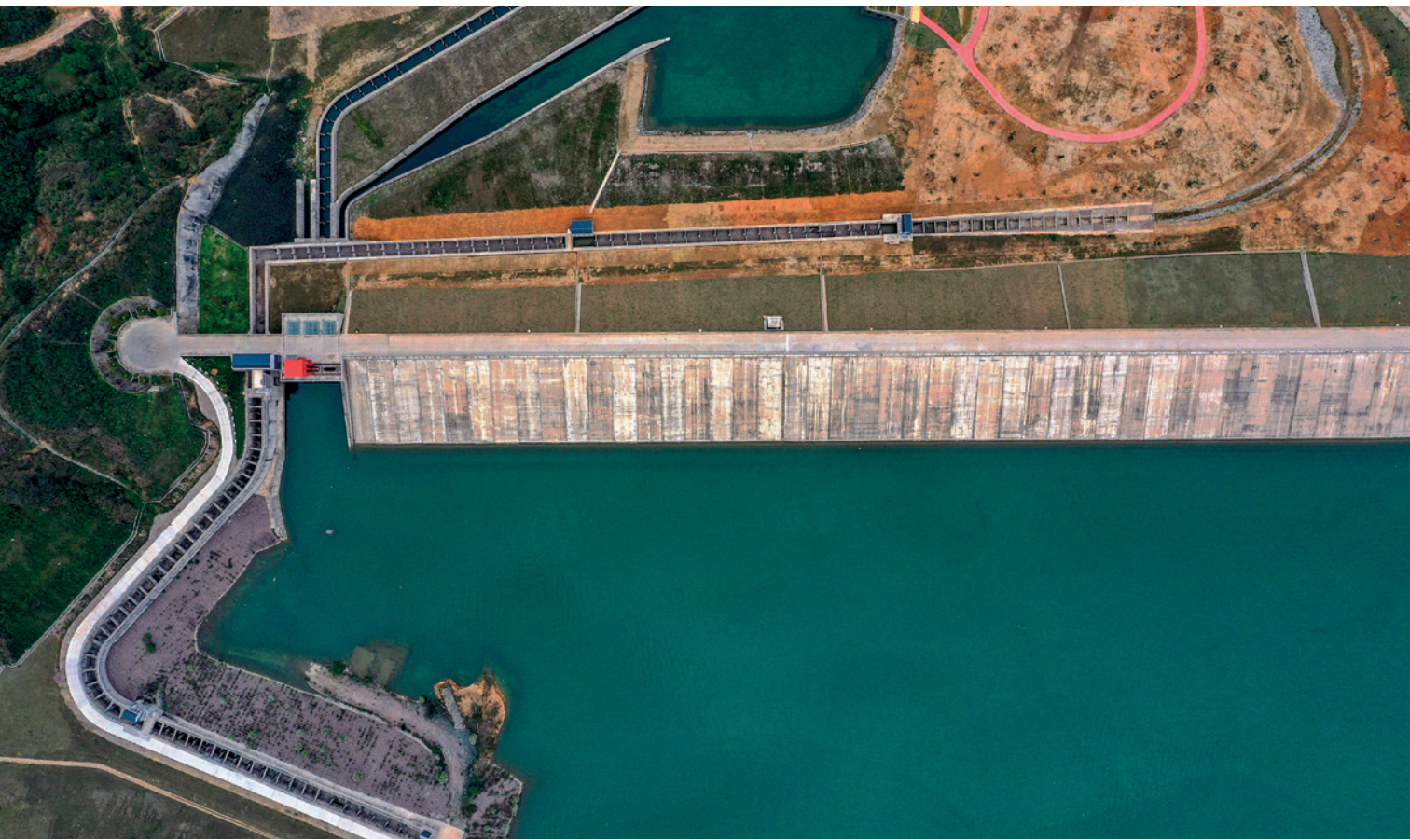
Aerial photo taken on March 11 shows the fishway of the auxiliary dam in Nanmu River of the Dateng Gorge water conservancy project in Guiping, south China's Guangxi Zhuang Autonomous Region. Cao Yiming