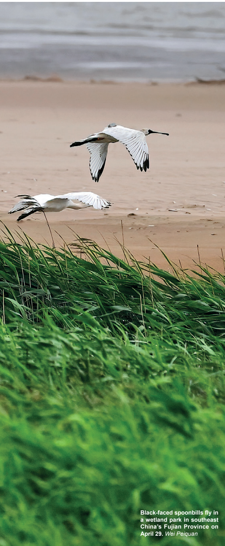
Black-faced spoonbills fly in a wetland park in southeast China's Fujian Province on April 29. Wei Peiquan