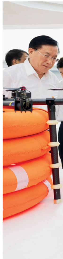
Li Zhanshu, member of the Standing Committee of the Political Bureau of the Communist Party of China Central Committee and chairman of the NPC Standing Committee, visits an industrial park of the Hubei Xingfa Chemicals Group Co., Ltd. in Yichang, central China's Hubei Province, on June 30.