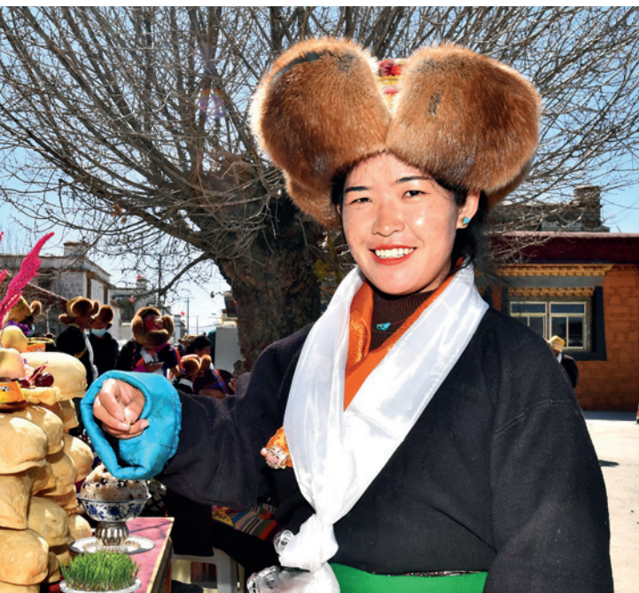
People dressed in traditional costumes celebrate the Tibetan New Year in Shannan, southwest China's Tibet Autonomous Region, on March 3.

in various ethnic styles, including a Tibetan liquor vessel, an Islamic-style alarm clock, and Han-style ceramic horses.