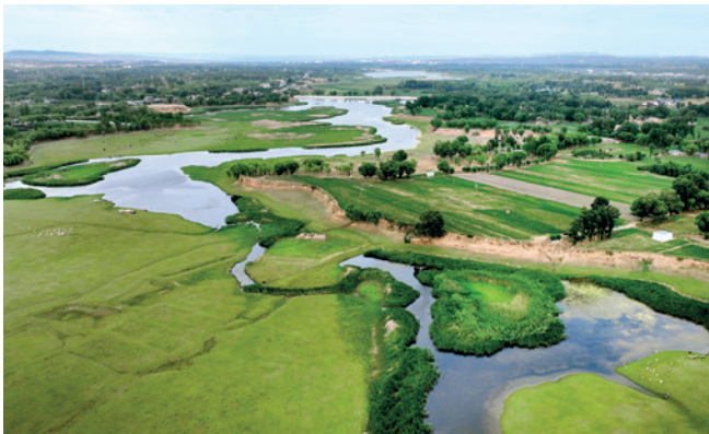
Aerial photo taken on July 19 shows the wetland near Jingbian County in Yulin City, northwest China's Shaanxi Province.

He also underlined accelerating the transition to a green and low-carbon economy along with achieving green recovery and development.