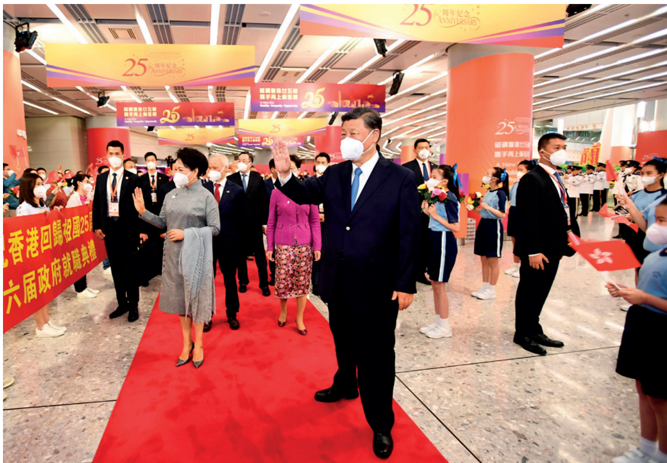
President Xi Jinping and his wife Peng Liyuan wave to the welcoming crowd upon their arrival in Hong Kong on June 30.