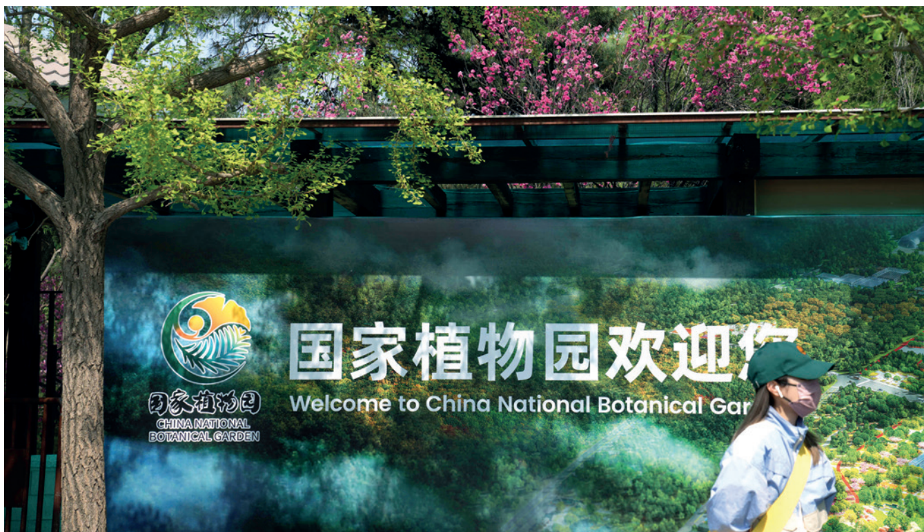
The entrance of the China National Botanical Garden is seen in China's capital Beijing on April 18. Ju Huanzong

Environment (MEE) in January. The improvement has been made thanks to the Air Pollution Prevention and Control Action Plan released by the State Council in 2013. The plan set the target of reducing the concentrations of PM 2.5 —harmful particles with a diameter of 2.5 microns or less—in cities at or above the prefecture level by 10 percent by 2017 from the 2012 levels.