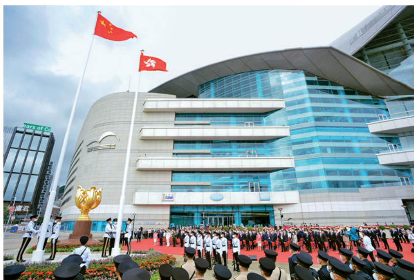
A flag-raising ceremony is held by the government of the Hong Kong Special Administrative Region to celebrate the 25th anniversary of Hong Kong's return to the motherland at the Golden Bauhinia Square in Hong Kong, south China, on July 1.