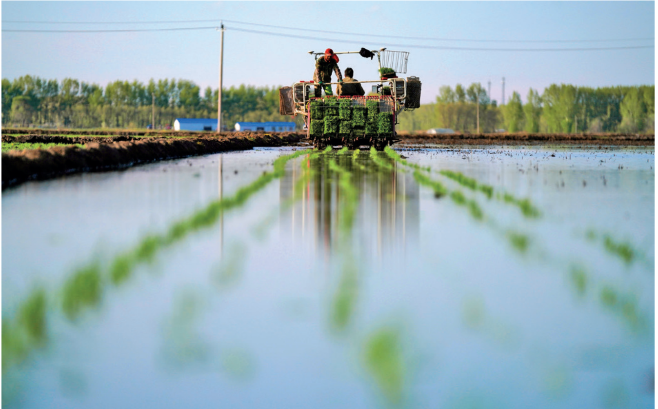
Farmers transplant rice seedlings in a field in northeast China's Heilongjiang Province on May 18.