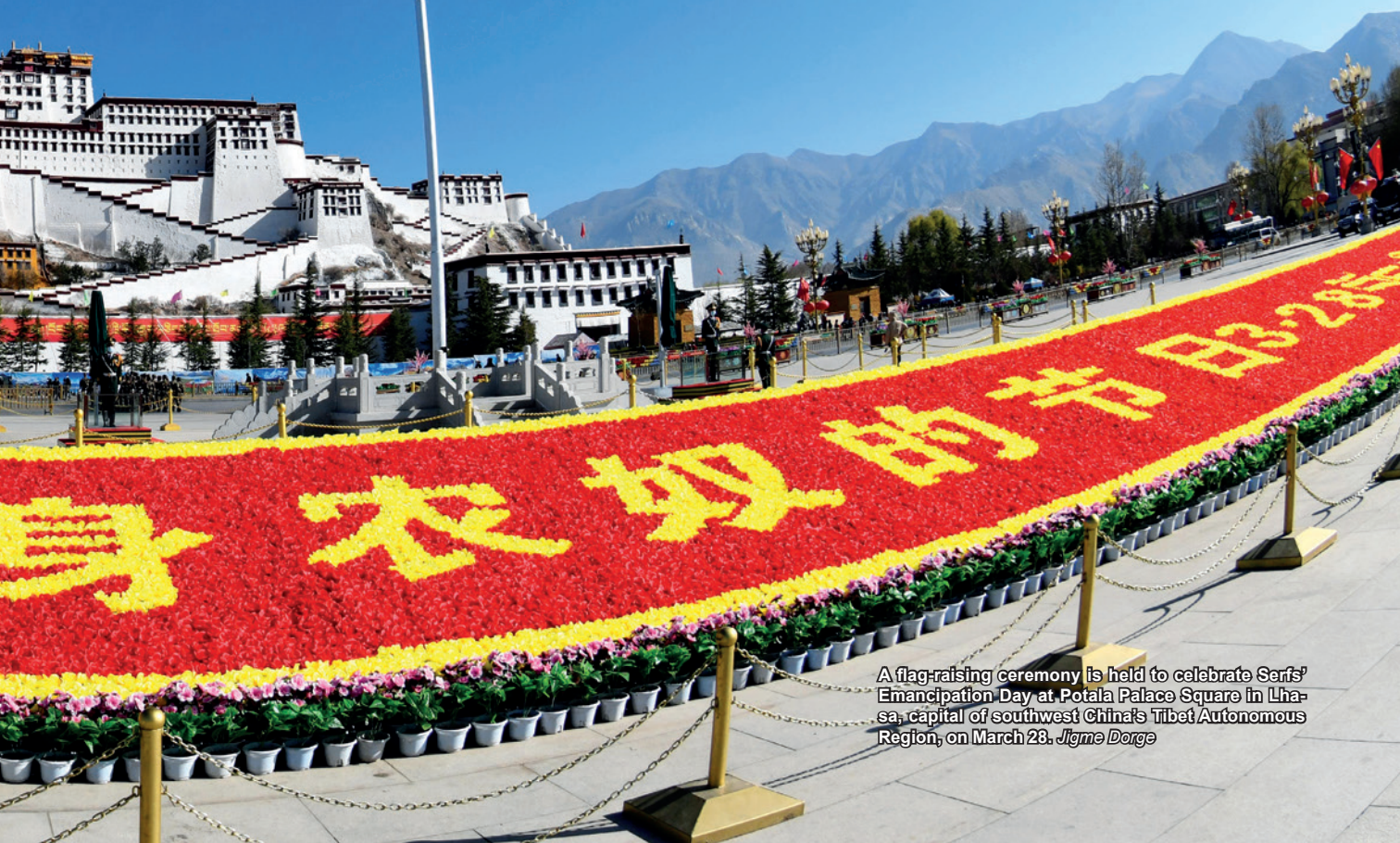
A flag-raising ceremony is held to celebrate Serfs' Emancipation Day at Potala Palace Square in Lhasa, capital of southwest China's Tibet Autonomous Region, on March 23. Jigme Dorge