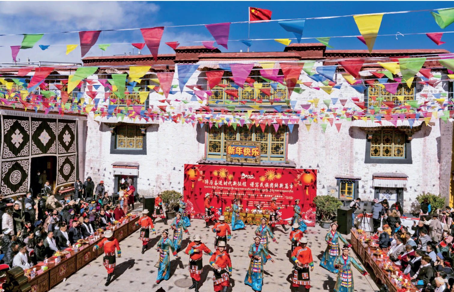
People of different ethnic groups dance and sing to celebrate the coming Spring Festival and the Tibetan New Year on Barkhor Street in Lhasa, southwest China's Tibet Autonomous Region, on January 26. Purbu Tashi