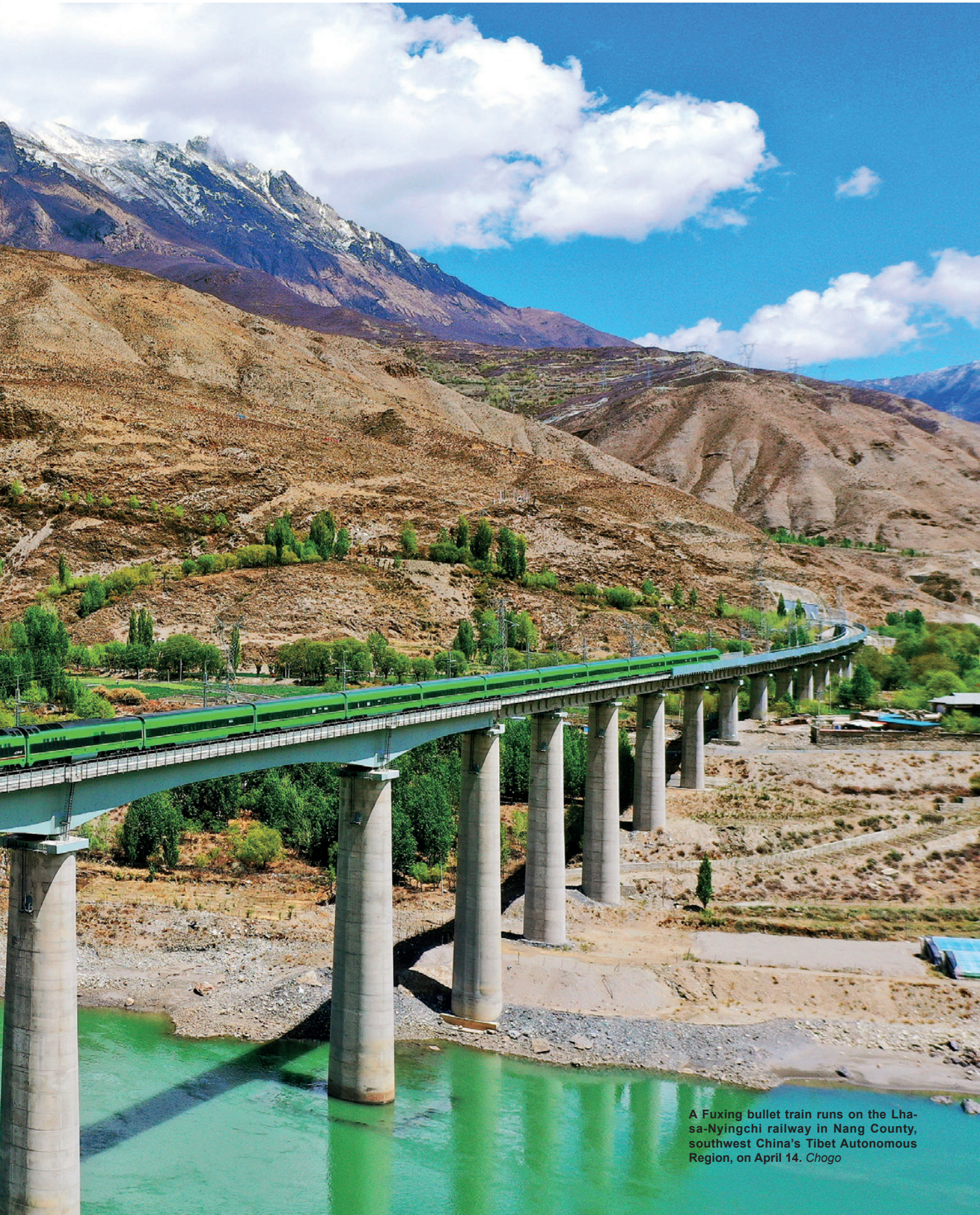
A Fuxing bullet train runs on the Lhasa-Nyingchi railway in Nang County, southwest China's Tibet Autonomous Region, on April 14. Chogo