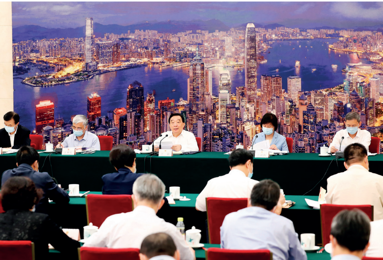
Wang Chen (center), member of the Political Bureau of the Communist Party of China Central Committee and vice chairman of the NPC Standing Committee, addresses a meeting of the Yangtze River Protection Law enforcement inspection team in Beijing on June 28.

At the meeting, Wang urged the team to carry out the inspection with solid efforts, adding that the restoration of the Yangtze River ecological environment must be given top priority in accordance with the law, added Wang. (Xinhua) ■