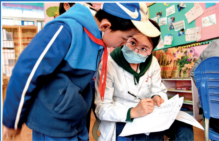
A medical expert registers a student for CHD screening in Qushui County of Lhasa, capital of southwest China's Tibet Autonomous Region on April 22. Zhang Rufeng