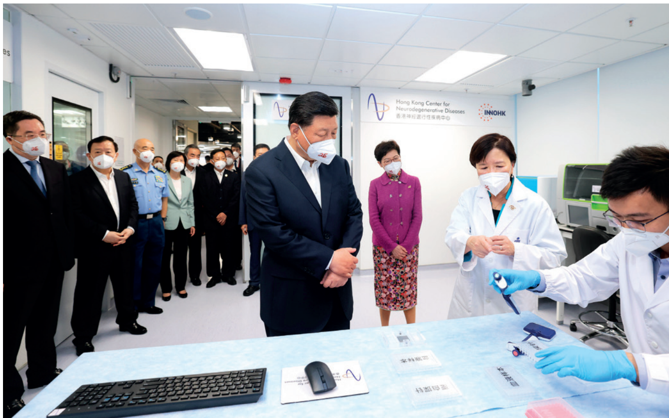
President Xi Jinping visits the Hong Kong Center for Neurodegenerative Diseases in Hong Kong, south China, on June 30. Liu Bin

The new electoral system followed in 2021. The amended Annex I and Annex II to the Basic Law of Hong Kong SAR, respectively concerning the method for electing the Hong Kong SAR chief executive and the method for the formation of the Hong Kong SAR Legislative Council (LegCo) and its voting procedures, were passed during a session of the National People's Congress (NPC) Standing Committee in March of the year.