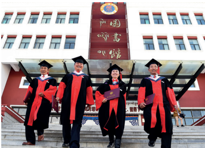
Doctorate graduates, cultivated in southwest China's Tibet Autonomous Region, proudly walk together on May 23, 1951.