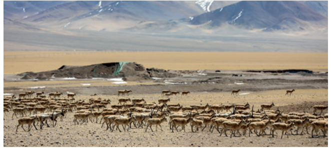
Aerial photo taken on March 27 shows Tibetan antelopes in Gerze County of Ali Prefecture, southwest China's Tibet Autonomous Region. Penba