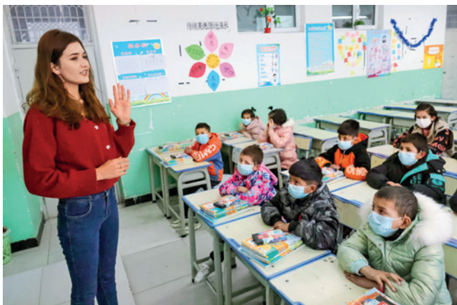
Students in class at a primary boarding school in the county seat of the Taxkorgan Tajik Autonomous County, northwest China's Xinjiang Uygur Autonomous Region, on February 26. Ding Lei

"The inheritance of ethnic minority languages and cultures is well reflected in boarding schools, which have special courses in these fields, especially in the ethnic colleges, and children's health rights are also well protected there," Chang said. ■